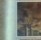
Painting on Gandhi of spinning wheels