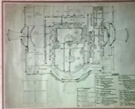
SITE PLAN OF MUSEUM BUILDING

By Train : SEALDAH (Main Line) to Baranagar Station. From there by Auto or by Bus (No. 81, 85, S34) to Mistriganj More. HOWRAH (Main Line) to Steamtrap Station & from there to Dhoighat by Ferry.